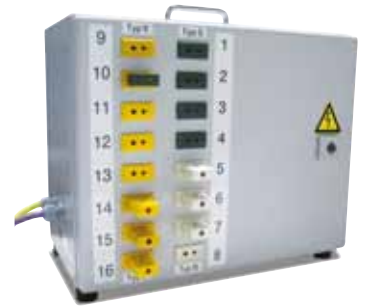
TUS module with ports for 16 thermocouples and PROFIBUS connection to the Nabertherm Control Center

The TUS module has its own PLC which converts the measurement results of the testing thermocouples. The evaluation, including an easy-to-navigate and simply log function, is then performed via the furnace's Nabertherm Control Center.