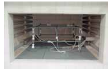
Measurement set-up in an annealing furnace