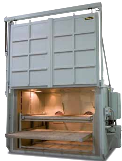
N 12012/26 HAS1 according to AMS 2750 D

As an alternative to instrumentation with the Nabertherm Control Center (NCC) and PLC controls, instrumentation with controllers and temperature recorders is also available. The temperature recorder has a log function that must be configured manually. The data can be saved to a USB stick and be evaluated, formatted, and printed on a separate PC. Besides the temperature recorder, which is integrated into the standard instrumentation, a separate recorder for the TUS measurements is needed (see page 68).