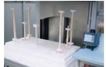
Measurement set-up in a high-temperature furnace